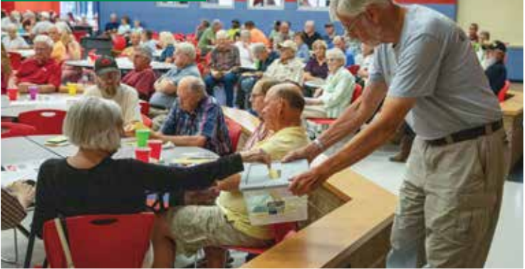
Ballot votes were cast for the Director Election.

to reducing line loss, stating the number was reduced by one-quarter of one-half percent. “Every tenth of a percent in reduction is savings,” she said, crediting much of the reduction to the co-op’s vegetation management program.