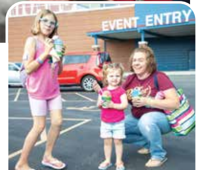
Families enjoyed a sweet treat from Kona Ice snow cones.