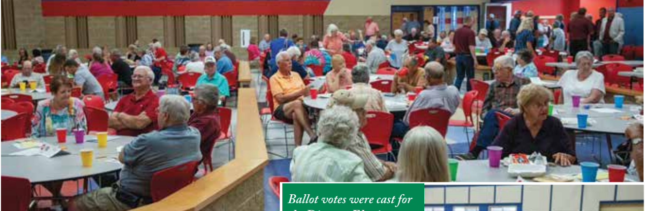
Members enjoyed a grilled pork chop dinner by the Mason County Pork Producers while visiting with friends and neighbors.