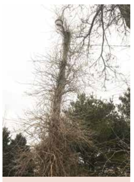
It's not just trees that cause problems. One of our linemen discovered this trumpet vine this winter when it prevented him from accessing a pole. We've also seen mailboxes, planters, signs and other items directly attached to poles. It is important that our poles are kept clear of all attachments.

Our specifications are to clear the area on either side of our single phase lines at least 15 feet and three phase lines at least 25 feet. Smaller trees and brush under and close to lines are removed to allow access and eliminate future growing problems. We direct all tree trimming crews to trim to the American National Standards Institute requirements to assure the continued health of trees. Some members may not view these standards as the most visually appealing, but they are healthier for the tree in the long term and