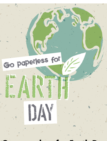
Go paperless for Earth Day this month by enrolling in paperless billing. Visit our online account portal at menard.com and select Account Management/ Paperless Options. You will receive an email notification each month when your bill is ready to view.