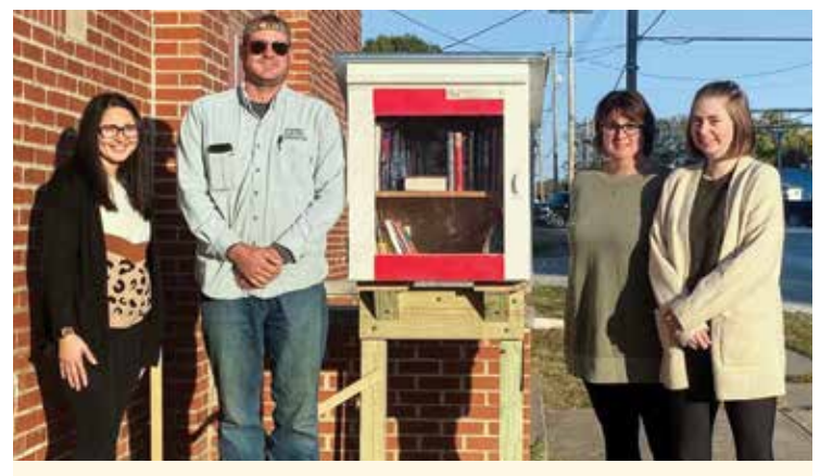
Oakford: At the town hall on 100 W Center Street

Installed in October the boxes have already seen good use by all ages, and we hope that continues for years to come. There's no better time to look for a Little Free Library near you to chase away cabin fever this winter. Locate the boxes we've built or visit the website littlefreelibrary.org to view a map and find a library near you.