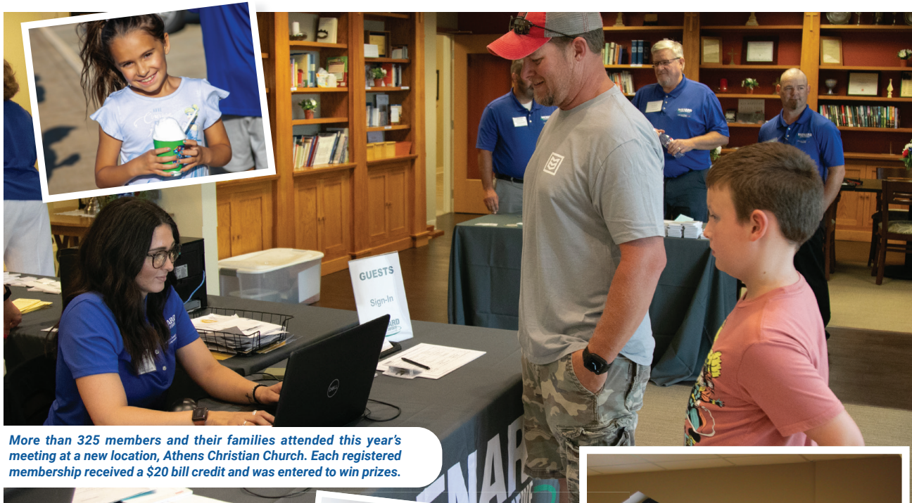
More than 325 members and their families attended this year's meeting at a new location, Athens Christian Church. Each registered membership received a $20 bill credit and was entered to win prizes.