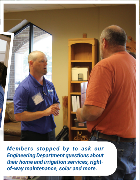
Members stopped by to ask our Engineering Department questions about their home and irrigation services, right-of-way maintenance, solar and more.

employees have accomplished many feats," said Anker. Some examples included interconnection of 63 member-owned distributed solar generation systems, bringing the total to just under 200 members; installation of over 5 miles of underground line and 75 new member services; and completion of 225 work orders to upgrade existing or retire unneeded services. The installation of 17.5 miles of overhead line by co-op and contract crews provided an upgrade in conductors, which improved the system line loss factor between substations and