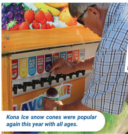
Kona Ice snow cones were popular again this year with all ages.