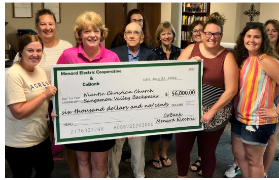
Niantic Christian Church's Sangamon Valley Backpack Program