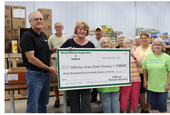
Athens Area Food Pantry

"The continued dedication of this group of volunteers to fill a need in their community is admirable, and we are pleased to support this program, particularly as food costs have continued to rise this summer," says Anker.