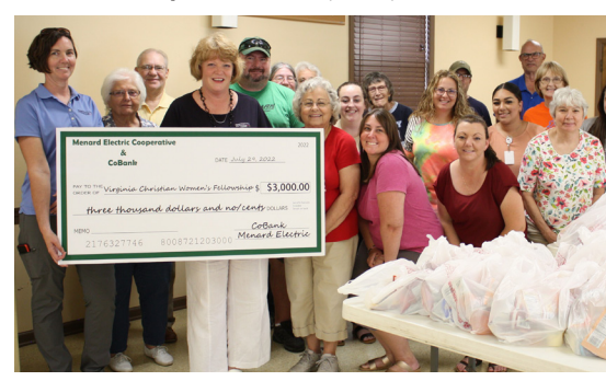
Virginia Christian Women's Fellowship