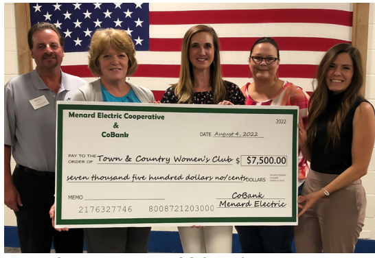
Town and Country Women's Club (TCWC)